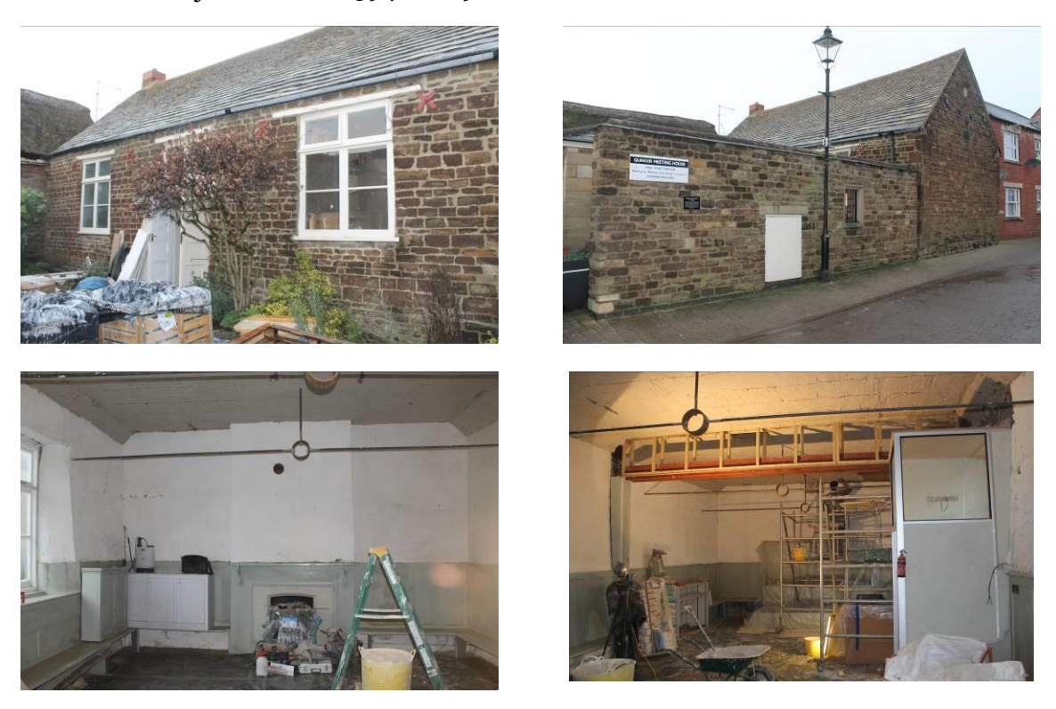
Statement of Significance

59 South Street, Oakham, LE15 6BG National Grid Reference: SK 85941 08691